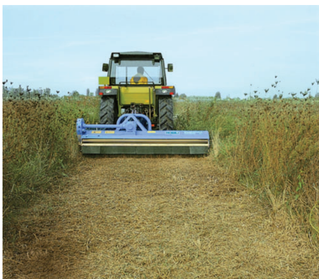
Figure 1. Mulching on set aside land, in order to comply with the cross compliance standard (Courtesy of Nobili S.p.A. agricultural machinery factory).

The same authors observed that uncontrolled weed plants on unmanaged set aside can reach a very high development (in some experiments conducted in Perugia the dry biomass of plants on a set-aside was between 4 and 9 Mg ha -1 year -1 ). Consequently, weed control through tillage, mulching, herbicides and cover crops is needed. Early tillage (by mid May) is not sufficient to prevent the development of late thermophilic weed species ( Portulaca oleracea , Echinochloa crus-galli ,