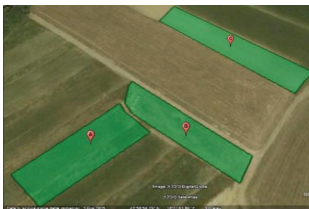
Figure 4. Fagna experimental areas (A, B, C) (in green), characterized by the biological class V (D'Avino, 2002).