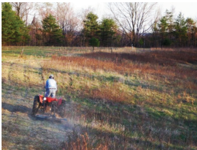
Figure 2. Late mowing on set aside is not able to control the increase of weed spreading. In this example brown plants reveal that dissemination of weeds occurred massively.