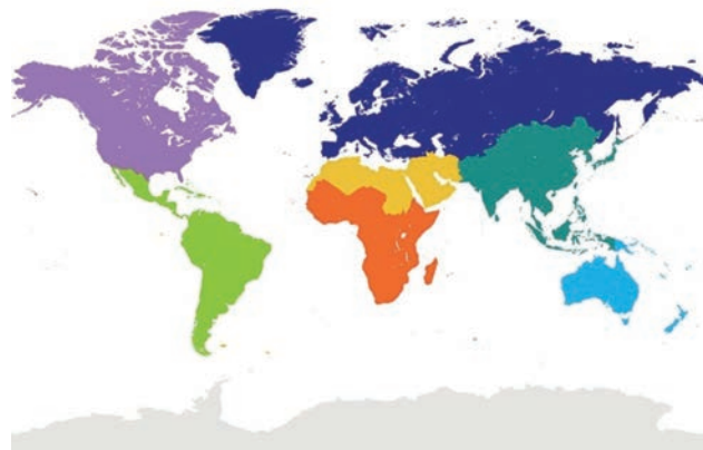
Figure 2. The seven Regional Soil Partnerships (RSP) (FAO, 2020).