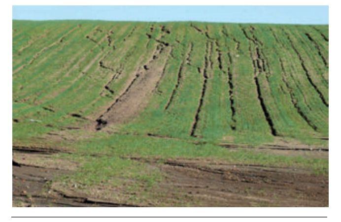
Figure 7. Tor Mancina Farm. Detail of the basin were temporary ditches were not made (Counterfactual) which shows the development of severe rill erosion.

The statistical analysis of data (Table 1) shows a strong and highly