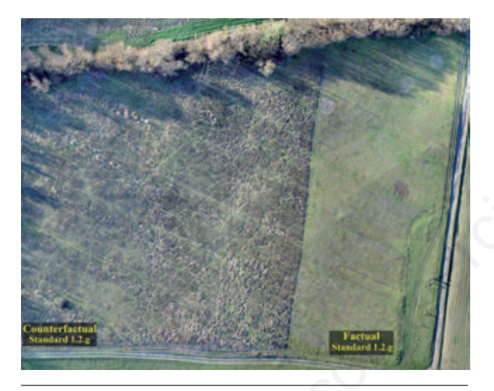
Figure 12. Visual evidence of complete lack of rills on plots where the Standard 1.2g was applied. Only walkways and traces of soil tillage prior to set-aside (that cannot be attributed to erosion) are distinguishable.

In the Factual thesis (aside from production with management of vegetation cover by shredding once a year) the decrease in soil erosion was of 89.7% (0.55 t ha<sup>-1</sup> year<sup>-1</sup>). In the counterfactual 1 thesis (set aside, not managed, covered by Mediterranean stain) erosion approached zero (0.0003 t ha<sup>-1</sup> year<sup>-1</sup>) compared to bare soil. The Factual thesis (set aside with shredding once a year) shows to be significantly effective in reducing runoff of 96.1% compared to bare soil, passing from 89.65 m<sup>3</sup> ha<sup>-1</sup> year<sup>-1</sup> to 3.51 m<sup>3</sup> ha<sup>-1</sup> year<sup>-1</sup>. Runoff volumes on factual thesis (set aside with Mediterranean stain) which showed an average runoff of 1.40 m<sup>3</sup> ha<sup>-1</sup> year<sup>-1</sup>.