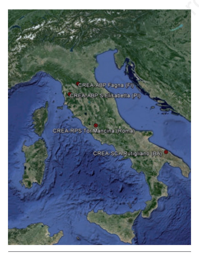
Figure 1. Location of monitoring sites.