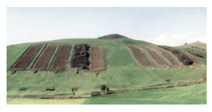
Figure 3. Plots for measuring runoff and erosion in the Santa Elisabetta farm.