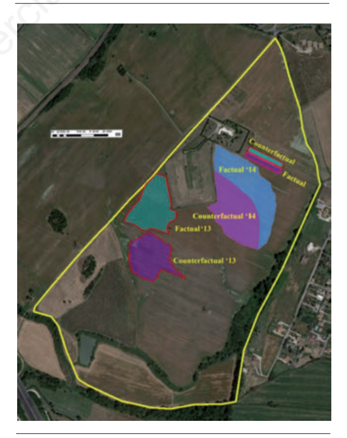
Figure 5. Tor Mancina CREA-RPS farm and location of monitoring sites of Standard 1.1_a .