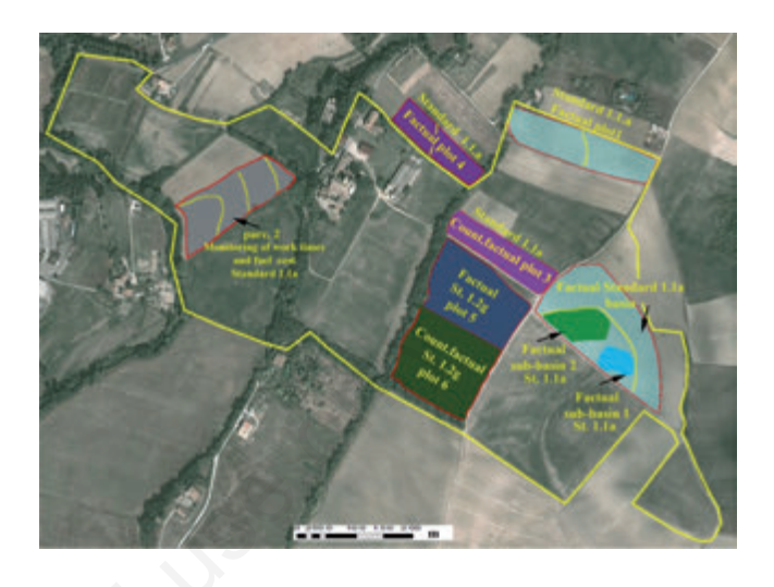
Figure 4. Fagna farm (CREA-ABP) and location of monitoring sites.

Factual-thesis plots are shown in Figure 4 with the number 5. The Counterfactual plot is shown in Figure 4 with the number 6.