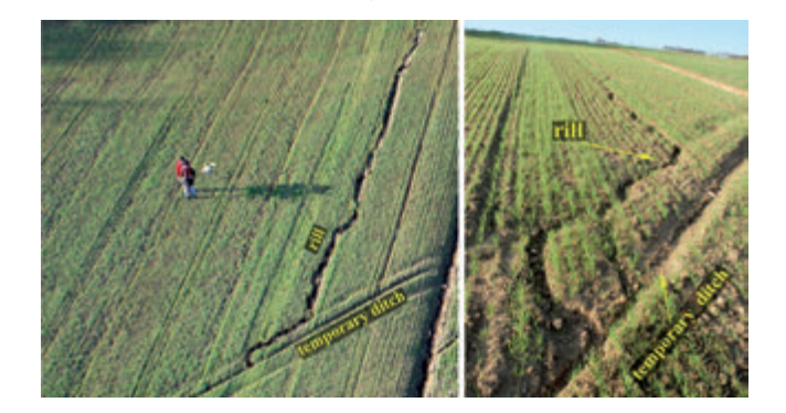
Figure 10. Visual demonstration of the effectiveness of temporary ditches in interrupting the development of rill downditch and consequently in reducing soil erosion. On the left, seen from drone. On the right, ground picture of the zone of hydraulic connectivity between rill and ditch (Fagna farm).