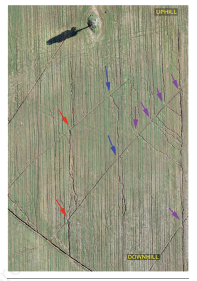
Figure 11. Zenithal picture from drone that illustrates the zones of breakage of the temporary ditches because of their undersize. Arrows of different colours identify different rills and indicate points where runoff has not been effectively intercepted by ditches, causing a 'domino effect' of concentration of erosion downstream (Tor Mancina farm).

Figure 10 shows, in a visual way, the effectiveness of the temporary ditches to intercept runoff and to decrease the formation of rills downditch. On the contrary, Figure 11 shows the disastrous effect of concentration of runoff and the ineffectiveness of temporary ditches where they are not able to fulfil their function of channelling all the volume of runoff water due to undersizing.