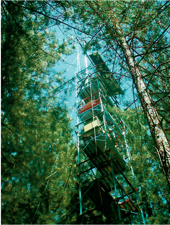
Figure 1. System for measuring carbon fluxes and evapotranspiration in forest of black pines in the Parco Nazionale della Sila (Calabria).

profile (0-90 cm). These conditions have occurred repeatedly in recent years, when evapotranspiration varied between 2 and 4 mm per day along the growing-season, with overall evapotranspiration losses of 200 to 400 mm. Precipitation during the growing season in Collesongo was generally sufficient to offset the water losses caused by ET but even in this case, the rainfall distribution should be carefully considered. In fact, one third of the seasonal rainfall, up to 150 mm, can be concentrated between mid-September and mid October, during the late growing season, when ecosystem functionality start to decrease, while a significant proportion (up to a quarter) may fall in the month of May, when the forest is leafing out and Leaf Area Index is growing from zero to full coverage.